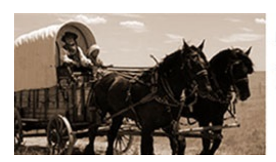
The 3 Pioneer Survival Lessons We Should All Learn

Click on the image bellow and learn the 3 pioneer survival lessons that you should know.