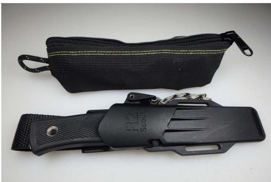
Figure 2 – Tool pouch next to a little Fallkniven R2 Scout.

I take a layered, modular approach survival equipment and supplies. Like most other survivalists, I carry a few tools on my person, and more in my Go Bag, which is a bag or satchel that I carry, more still in my vehicle, and more still at fixed sites such as my home and bugout locations. Modules and layers enable me to adapt by lightening my load to improve mobility or adding to it to gain capability and increase sustainment time.