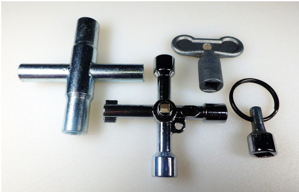
Figure 3 – I sought a solution to the heavy, bulky sillcock key at left. Eventually realizing I only used the 5/32" key over several years, I created a compact, lightweight tool for my tool pouch.