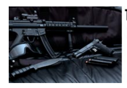
The government wants to take all your guns. But they can't get THIS ONE from you. Watch video »

Always use quick access lockable safes when hiding loaded weapons for quick accessing in times of extreme danger. If you do not have a quick access safe, use a 50 caliber ammo can that can be locked and secured to the floor.