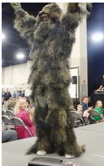
RedRock Ghillie Suit