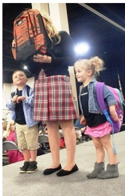
Bullet-resistant School Bags