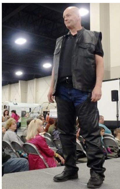
Bullet-resistant Biker Vest