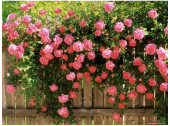
Climbing variety of roses

As a homeowner, you can go to great lengths to fortify your home and property to protect it against thieves and home invaders. Fortunately, you don't need to shell out a ton of cash on hi-tech alarms and cameras to deter them. Instead, all you need is to make it more difficult for them to access your home 's weakest entry points from the outside.