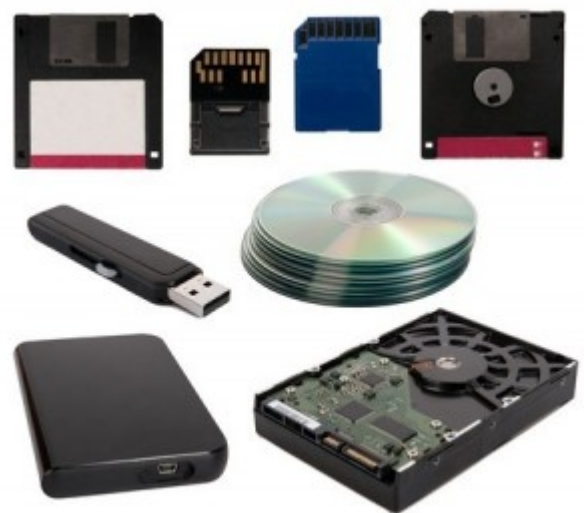
DATA STORAGE DEVICES

Once you select distros of interest, it is very important to make sure that you keep an eye out for updates.