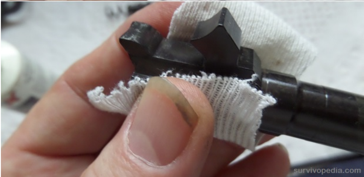
cleaning the barrel

Step 25- To reassemble the slide first carefully install the barrel in the front of the slide with the muzzle down and the rear facing slightly upward. Then push the barrel down and into the lower larger hole of the slide to mount the barrel in the slide.