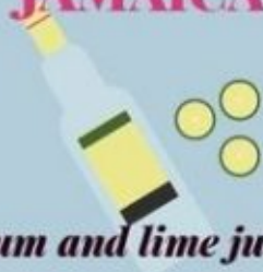
Rum and lime juice

Overproof rum and lime juice, a combination that helps 'sweat the cold out'