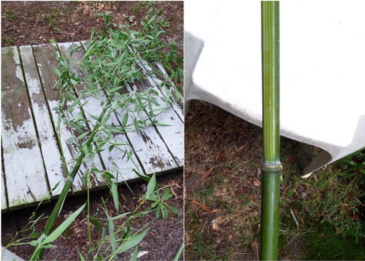
Bambus for Fishing Rod