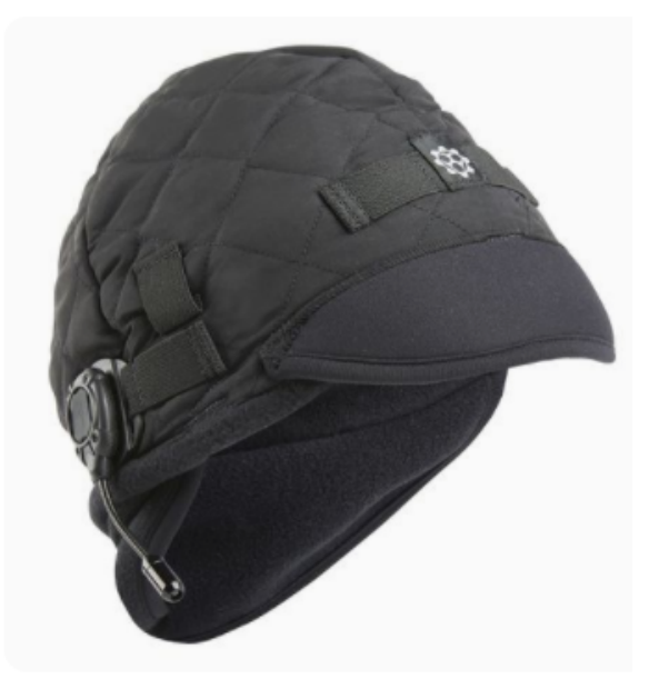
Ultimate Winter Survival Hat with point light pinterest.com

While reading an old cowboy's description of survival against all odds, one of the primary things stacked against the desert survivor was that he had lost his hat.