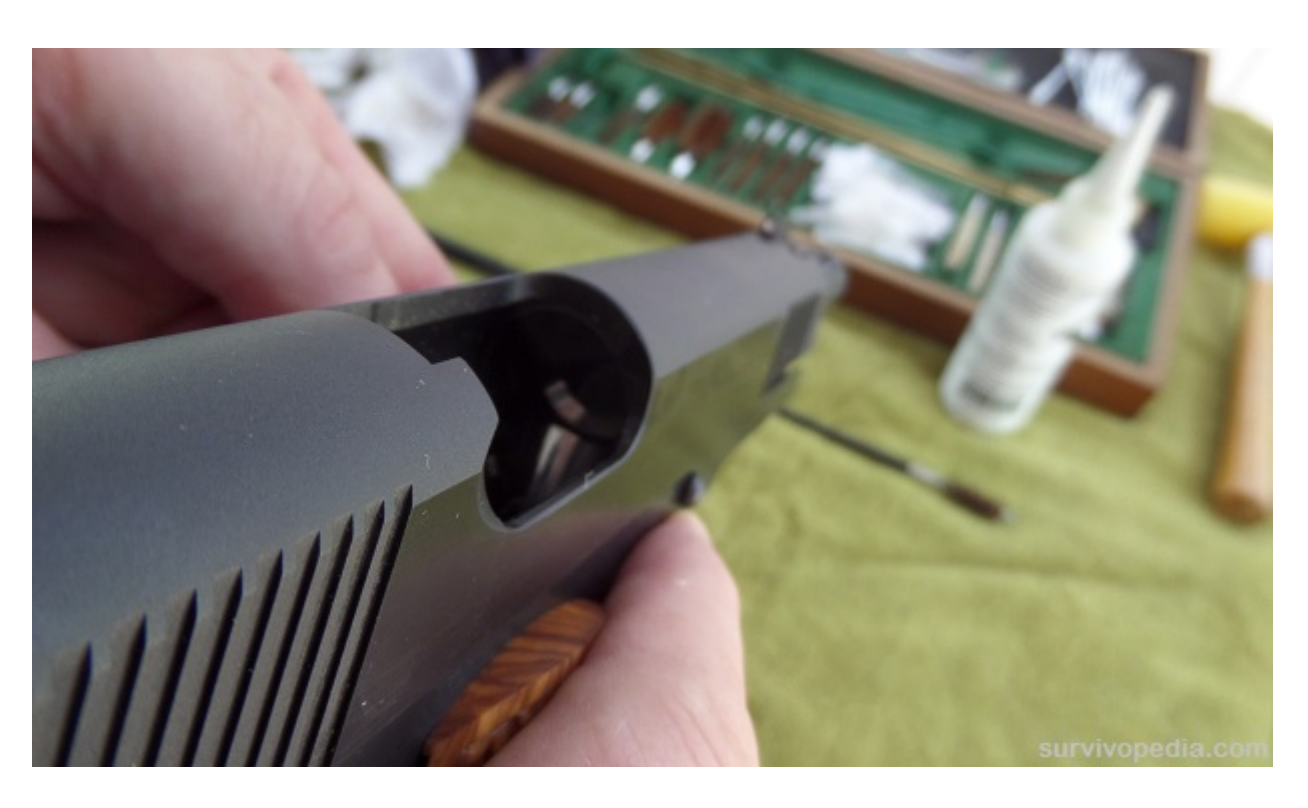
What Are the Golden Rules of Gun