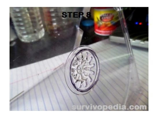
Step 7: Use the coping saw to cut out the inflow port.

<u>Step 6:</u> Look carefully at the central portion. If the spindle does not have holes in it, then you will need to drill to make some. (I used a Memorex jewel case that already had holes in it, so there was no need to modify the central portion.)