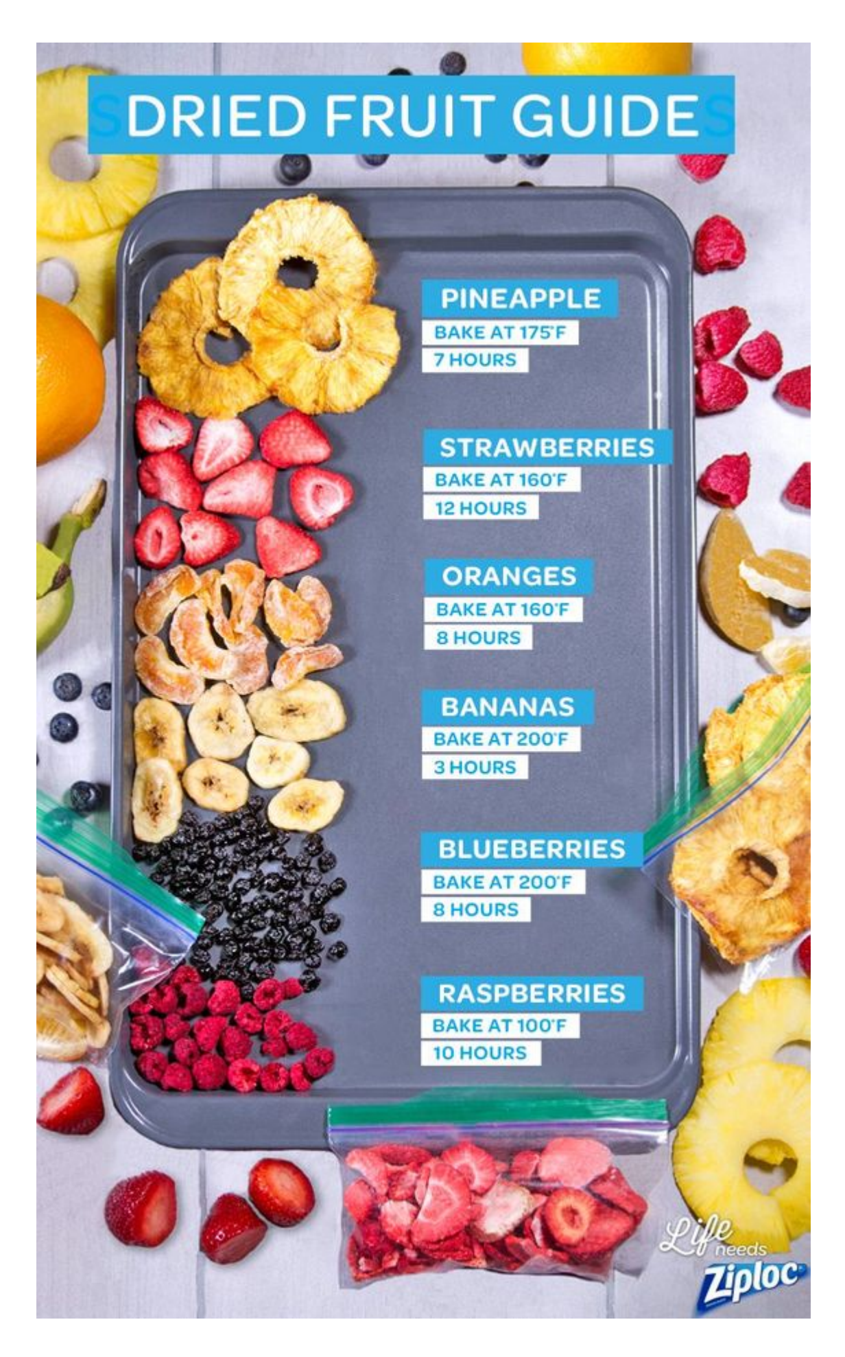
Extending Shelf Life of Dehydrated Fruits