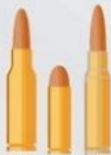
.440 WTBY MAG .416 RIGBY .577 NITRO EXP