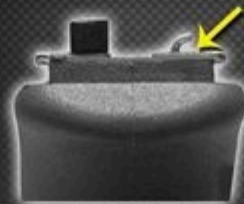
RIGHT SIDE FRAME VIEW