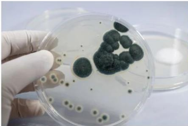
Figure 55 - Colonies of Penicillium fungi