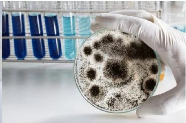
Figure 56 - Aspergillus mold