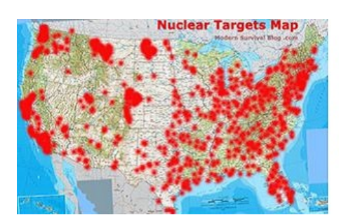
US Nuclear Target Map. Do You Live In The Death Zone?

Pattern of life is a key consideration when deciding shelter placement. There is about a 50% chance that the average American will be at home when a nuclear strike occurs, a 25% they will be at work and a 25% chance they will be somewhere else.