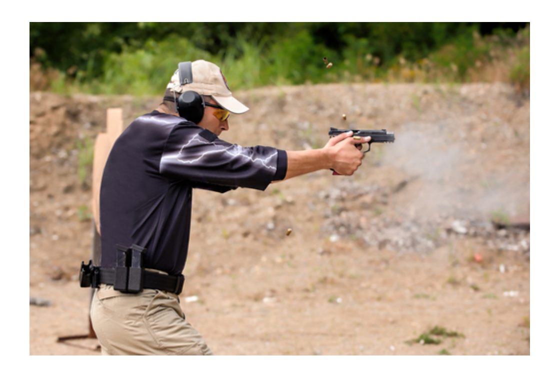
So why does this happen?

Perhaps you remember how it was during your school years, when at an important exam, you suddenly discovered you only had minutes left, and your hands would suddenly start shaking uncontrollably making it impossible to put down another word.