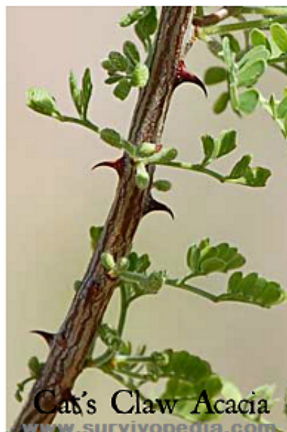
Cat's Claw Acacia

Trees with thorns on their trunk and branches are less likely to be scaled in order to get to a second floor window or balcony. Some examples include: