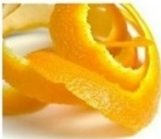
AVOCADO & CITRUS PEEL