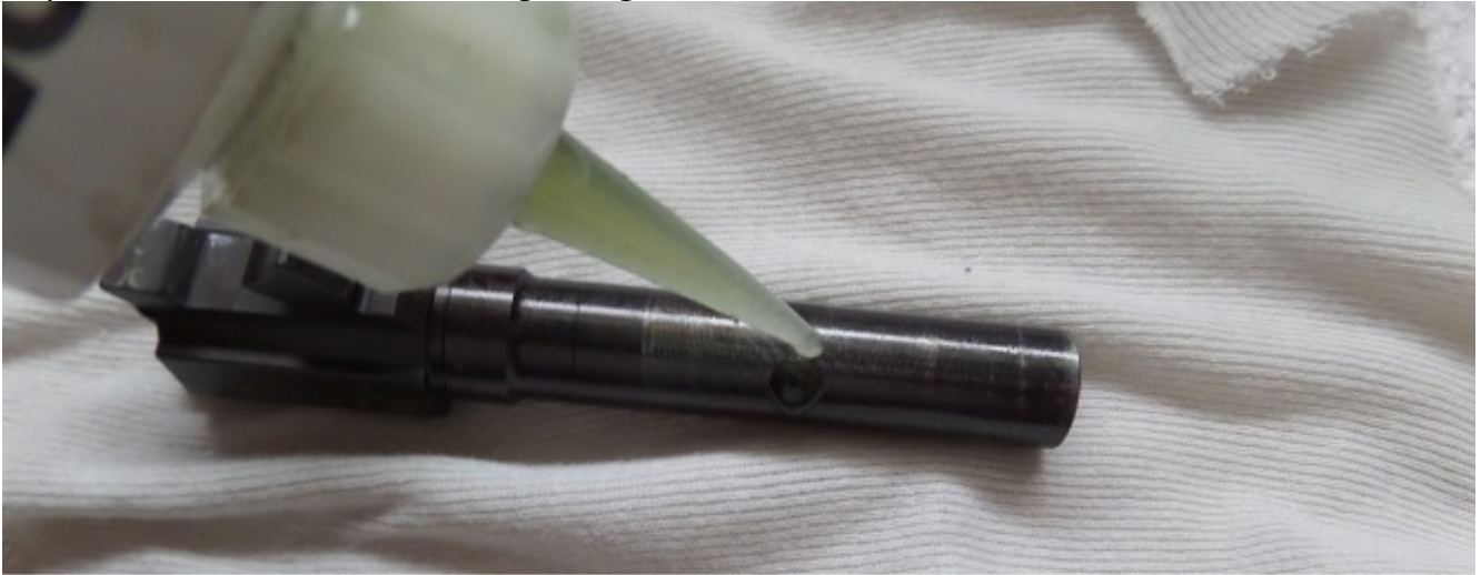
[caption id="attachment_13942" align="aligncenter" width="620"]