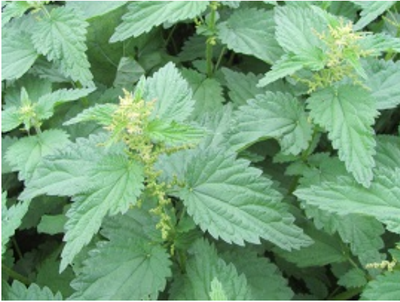
"Stinging Nettle - (Urtica dioica L. )

Is called stinging because of its stinging hairs called trichomes on the leaves and stems, which act like hypodermic needles. Grows 3 to 7 ft tall in the summer. It bears small greenish or brownish numerous flowers. The leaves and stems are very hairy with non-stinging hairs but many are stinging.